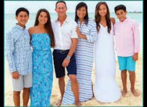
"The Rosenblum Family loves their smiles!"