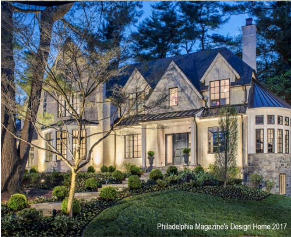
Philadelphia Magazine's Design Home 2017