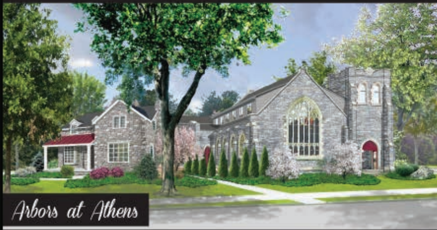
Arborgs at Athens